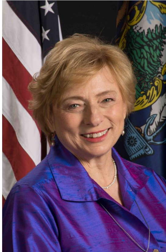
Janet T. Mills Governor of Maine

Compiled and edited by the Department of Administrative and Financial Services, Bureau of the Budget